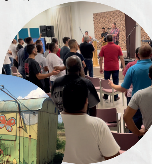
Men's Conference in Dobromirka

What a wonderful answer to prayer! Though the challenges of empty villages, poverty and the marginalised communities still exist, we can praise God he is raising up godly men to take responsibility and help make change happen.