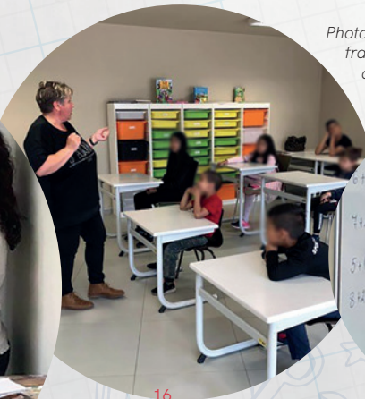
Photos: A young girl learns fractions; teaching the class; a young boy learns maths