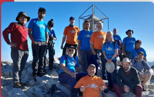
The Trek Musala team at the summit of Mount Musala

For fuller reports about the trek, visit www.ten-uk.org or watch our video updates on Facebook and Instagram.