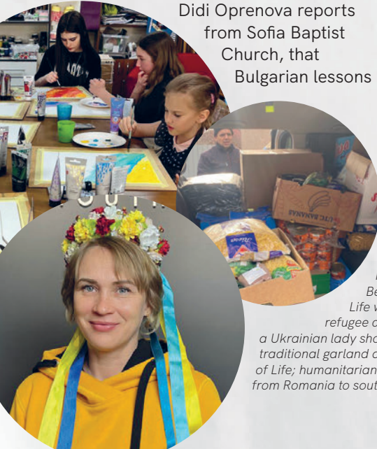
Photos: Beginning of Life work with refugee children; a Ukrainian lady shows off her traditional garland at Beginning of Life; humanitarian aid sent from Romania to southern Ukraine.