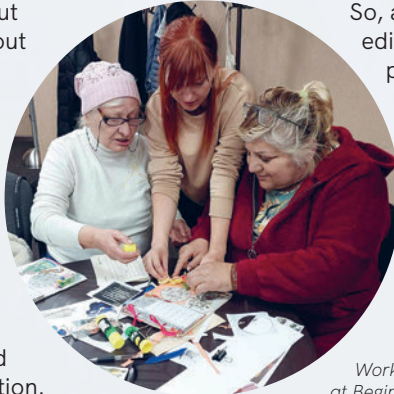
Work with Ukrainian ladies at Beginning of Life, Moldova

You will read about partners who work with people with disabilities, orphans, refugees, the homeless and people who have experienced desperate poverty. But you will also read about addicts—past and present. Perhaps you think these people have brought their situations on themselves, but we ask you to consider the abundant grace of God. One of our partners shares his testimony of how God freed him from addiction.