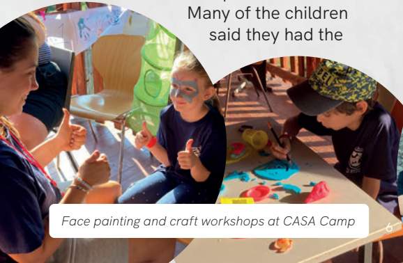
Face painting and craft workshops at CASA Camp

"...but those who hope in the LORD will renew their strength. They will soar on wings like eagles; they will run and not grow weary, they will walk and not be faint." (Isaiah 40:31)