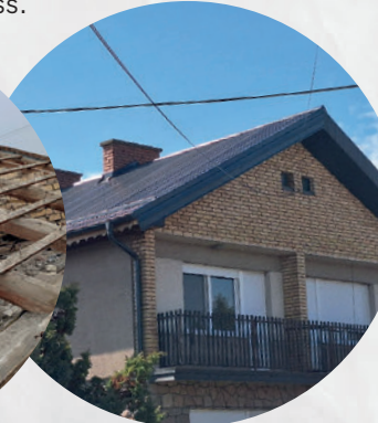
A flower placed on a tree; a car for ministry; Jovica and Savka's roof before and after repairs