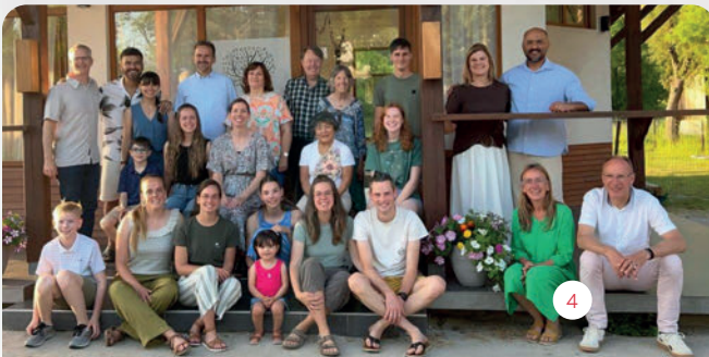
Refugees enjoy coffee and fellowship after the service (top); The Hope team in Hadžići (left)

It is a huge blessing and there is so much joy in being a part of what God is doing and allowing us to do among the refugees and migrants who come to our Hope Centre.